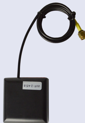
2.4/5.8G WIFI Antenna