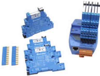
Relay module in i-7000 (1)