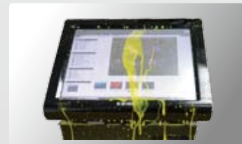
IP65 Front Bezel