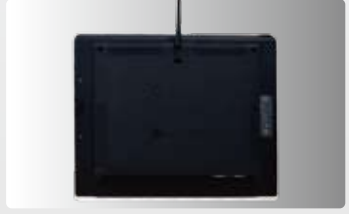
Aluminum Rear Housing Option WiFi & VFD