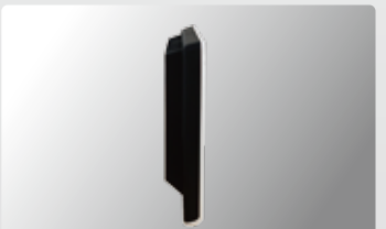
Super Slim Design