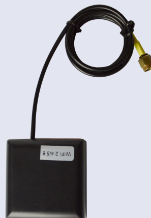
2.4/5.8G WIFI Antenna