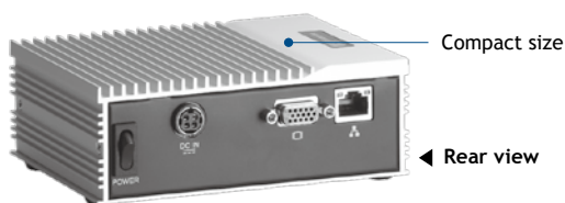
◀ Rear view