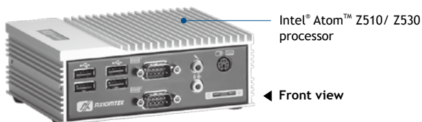
◀ Front view

Fanless Embedded System with Intel® Atom™ Processor Z510/ Z530 up to 1.6 GHz