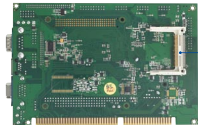
Compact Flash Type I/II