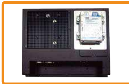
■ HDD Anti-Vibration Easy-install kit