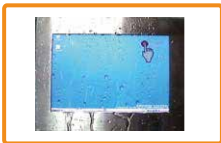
■ IP65 in Front & Side Frame